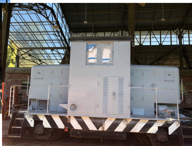
→ After Primer!!!