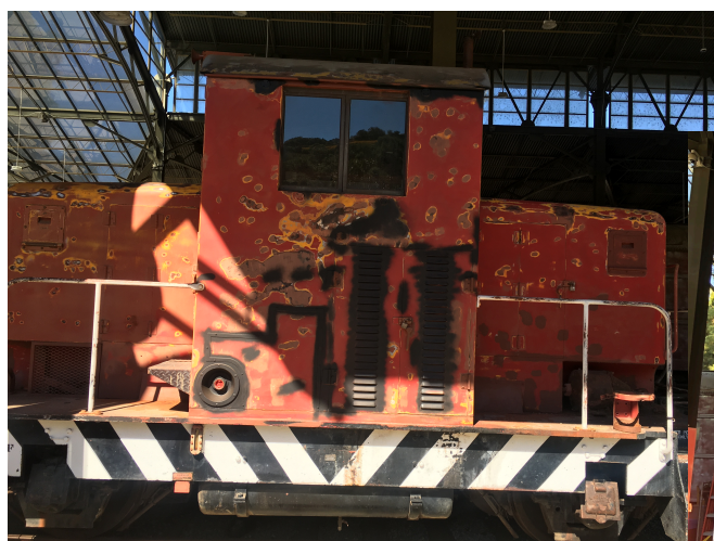
↑ Before primer