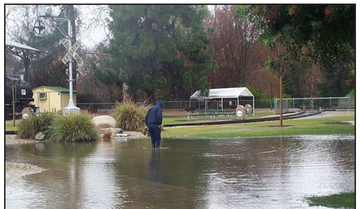
✎ Who says it never rains in Southern California?