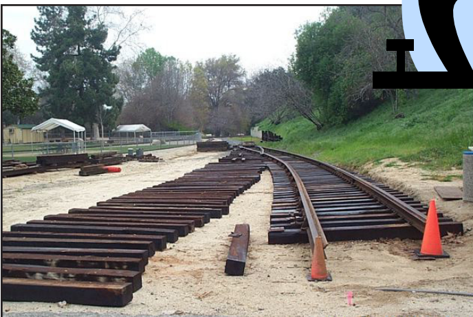
✎ By Valentines Day, the new Track One was all spiked down and ties were in place, ready for rails to be laid for Track Two! The three new "girder rail" tracks in this area of Travel Town will be used for maintenance work on the locomotives as well as the approach "leads" for the demonstration railroad passenger station.