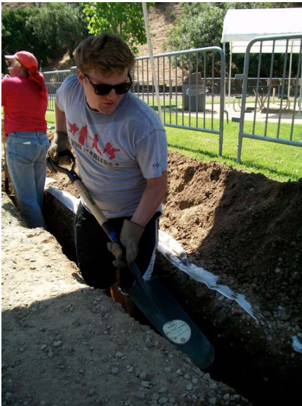
Like any good leader, Wade got down in the trenches with everybody else!