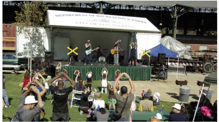
Kids of all ages enjoy the music featured at Travel Town Depot Day!