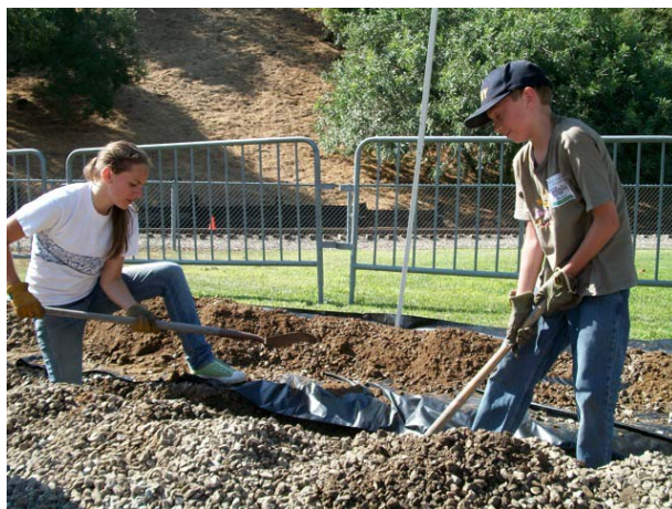
Sisters and brothers, everyone got into the act.