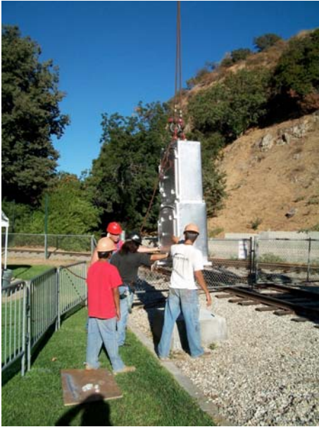
After the Museum had closed for the day, the installation team lifted the two refurbished signal cases into position on their new concrete foundations. Both the historic Navy locomotive crane and flat car were put to good use!