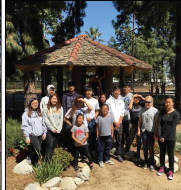
“Before” and “after” photographs of the Gazebo – and some of the great crew from Happy Village!

On the first Saturday of every month, Travel Town gets an extra burst of activity! Volunteers from the “Happy Village” of the Korean-American Development Center along with friends from the Wilshire Lions Club and their youthful counterparts, the “Leos” - come out and help us spruce up the Museum! In March, this fantastic group cleaned trains, repainted the waiting Gazebo, weeded along the tracks (a BIG job, given all the recent rains), cleaned up the center walkway of the locomotive Pavilion, (another BIG job, because a messy pair of crows have been living inside the Pavilion, leaving large twigs and droppings all over the walkways). The Happy Village even helped install our new Dining Car China Garden exhibit sign! Their combined efforts in one day resulted in over 75 hours of volunteering, and the place really looked great when they left! This group is a true example of community giving and support; every one of their members is excited to be here and does a great job, no matter how simple or complicated the task. Sometimes cleaning trains can be very tiring, but when you do it with several friends alongside, the work seems like play. This group has a great time at Travel Town and looks forward to every month’s new challenges. What’s next? Cleaning up the garden next to the train ride and the future Volunteer Center!