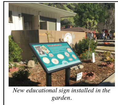
New educational sign installed in the garden.

On the first Saturday of every month, Travel Town gets an extra burst of activity! Volunteers from the “Happy Village” of the Korean-American Development Center along with friends from the Wilshire Lions Club and their youthful counterparts, the “Leos” - come out and help us spruce up the Museum! In March, this fantastic group cleaned trains, repainted the waiting Gazebo, weeded along the tracks (a BIG job, given all the recent rains), cleaned up the center walkway of the locomotive Pavilion, (another BIG job, because a messy pair of crows have been living inside the Pavilion, leaving large twigs and droppings all over the walkways). The Happy Village even helped install our new Dining Car China Garden exhibit sign! Their combined efforts in one day resulted in over 75 hours of volunteering, and the place really looked great when they left! This group is a true example of community giving and support; every one of their members is excited to be here and does a great job, no matter how simple or complicated the task. Sometimes cleaning trains can be very tiring, but when you do it with several friends alongside, the work seems like play. This group has a great time at Travel Town and looks forward to every month’s new challenges. What’s next? Cleaning up the garden next to the train ride and the future Volunteer Center!